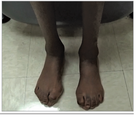
A and B, Tongue wasting and scapular winging in patient 2 carrying the p.Ala2OSer SPTLC1 variant. C and D, Tongue wasting and muscle atrophy of the lower limbs in patient 3 carrying the p.Ser331Tyr SPTLC1 variant. Note the hammertoe deformities of both feet.

March 2016 and January 2021. The Table summarizes the clinical features of the 4 patients. Detailed descriptions of each patient and their recruitment are available in the eMethods in the Supplement. All participants provided written informed consent for genetic analysis according to the Declaration of Helsinki, and the Institutional Review Board of the National Institutes of Health approved the study. Members of the FALS Sequencing Consortium, American Genome Center, International ALS Genomics Consortium, and ITALSGEN Consortium can be found in the eAppendix of the Supplement.